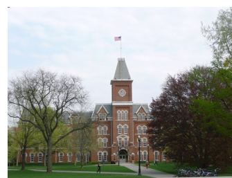
Ohio State University

If you are a self-motivated learner who enjoys meeting new people, and you would like to have a variety of experiences, a large university may be ideal.